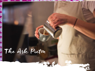
The Ark Picton