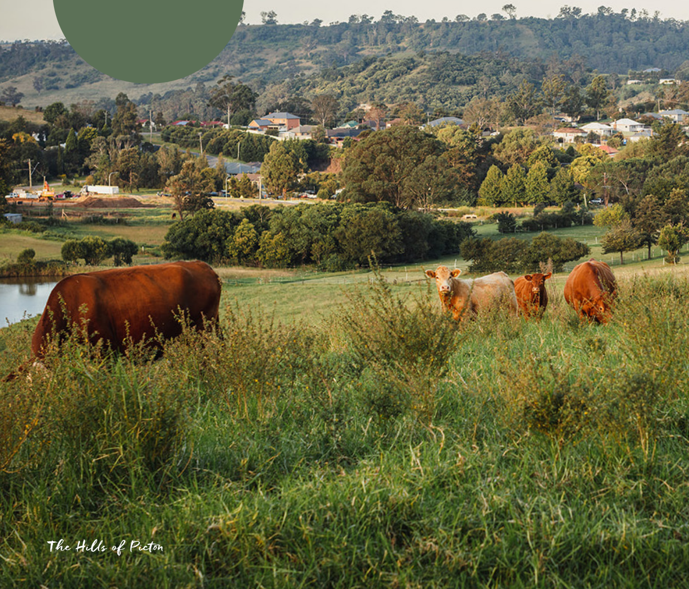
The Hills of Picton