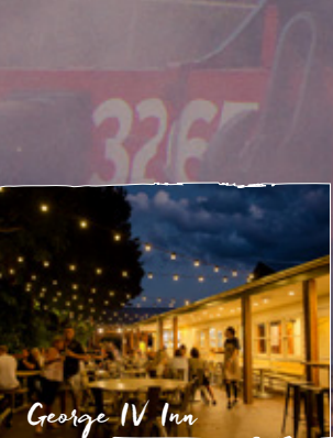
George IV Inn

Marvel the museum, board a steam train, walk the ancient lakes and settle in for a meal at one of Australia's oldest pubs.