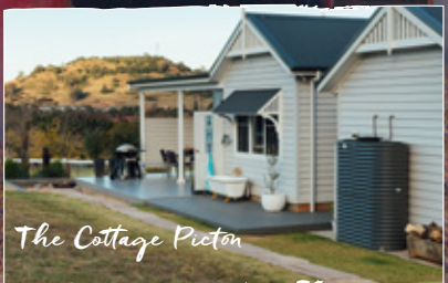
The Cottage Picton