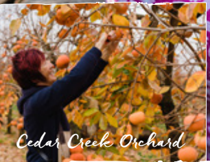
Cedar Creek Orchard