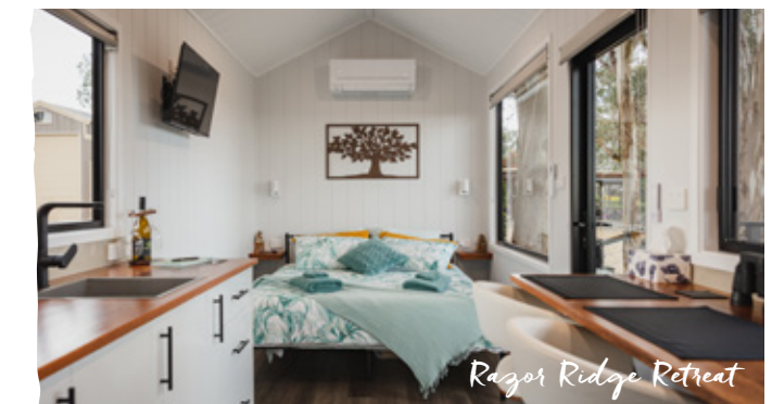
Razor Ridge Retreat