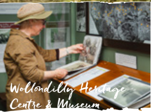
Wollondilly Heritage Centre & Museum